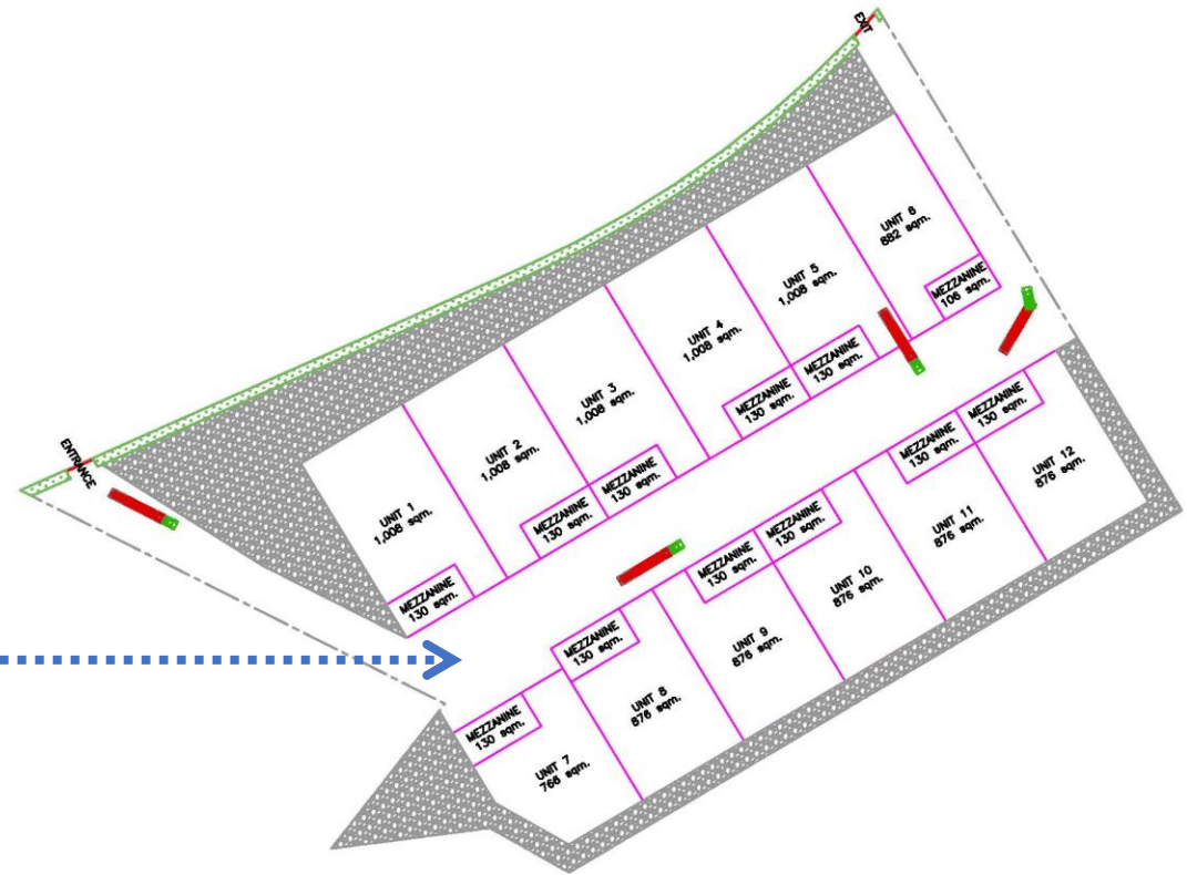
SITE DEVELOPMENT PLAN